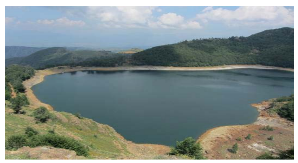
Ternoves Hydropower Plant, Albania