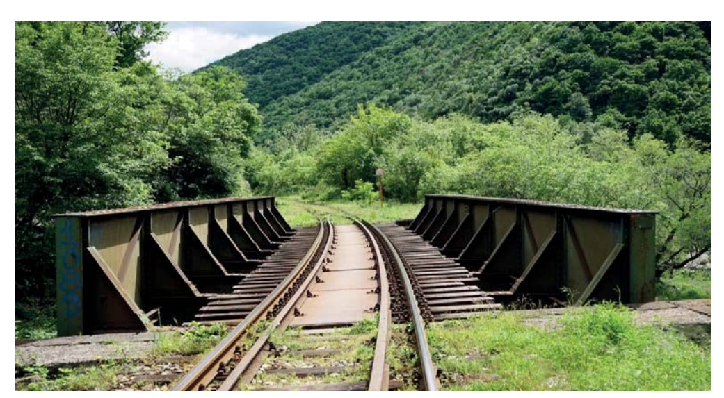
View of Non-electrified Railway Track on Corridor Xc, Serbia.