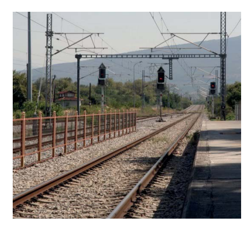
Existing Double-track Railway on Corridor X, Serbia.

This investment project<sup>1</sup> is part of the Core Network Corridors of the Trans-European Transport Network (TEN-T) extension into the Western Balkans and South East Europe Transport Observatory (SEETO)'s Core Network. It is thus included in the long-term sustainable development plans of the European Union and its partners. It covers the rehabilitation of the Sicevo to Dimitrovgrad railway track, including preparatory works for electrification and signalling and telecommunication systems.