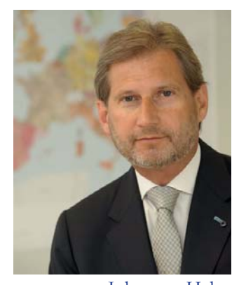
Johannes Hahn European Commissioner for Neighbourhood Policy and Enlargement Negotiations