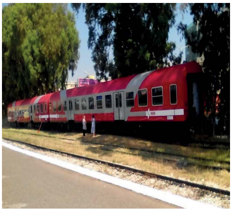
Durrës Railway Station, Albania.

This investment project<sup>1</sup> concerns the rehabilitation of the Tirana - Durrës railway section and the construction of a new railway link to the international airport in the capital. includina signalling and telecommunication systems. It is part of the Core Network Corridors of the Trans-European Transport Network (TEN-T) extension into the Western Balkans as well as South East Europe Transport Observatory (SEETO)'s Core Network.