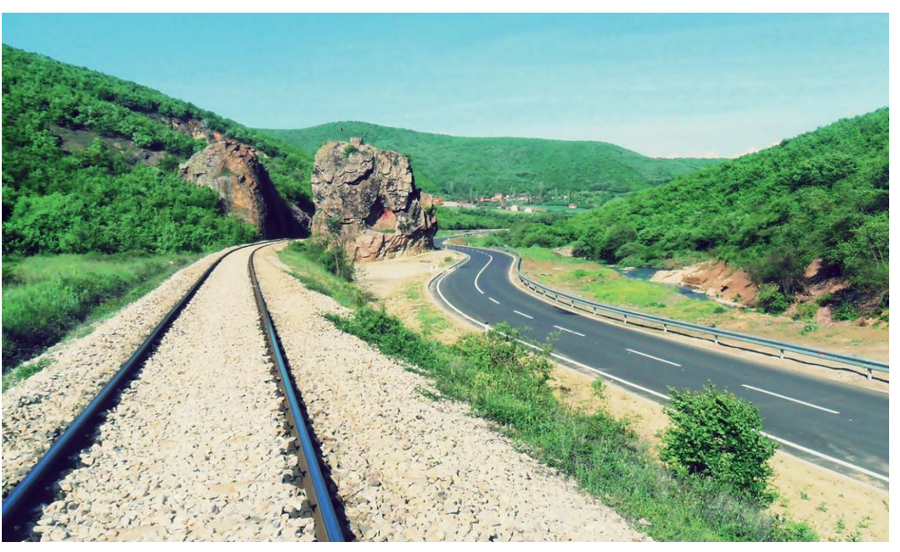
View of Non-electrified Railway Track in Drenicë/Drenica, Kosovo.