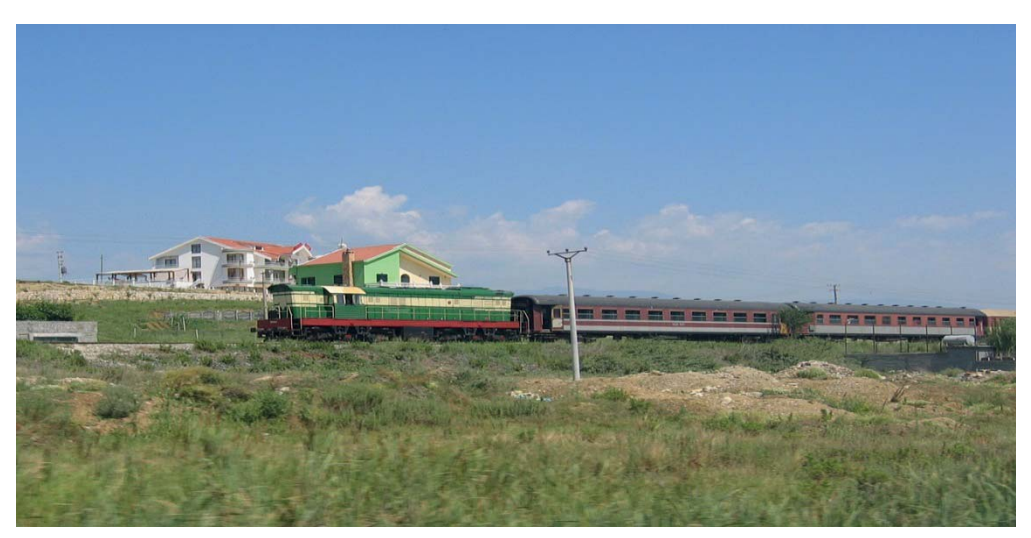
- HSH Train nearby Durrës.