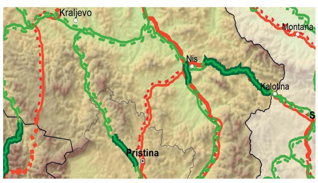
Map of R10, including the Fushë Kosovë/Kosovo Polje - Mitrovicë/Mitrovica Section.