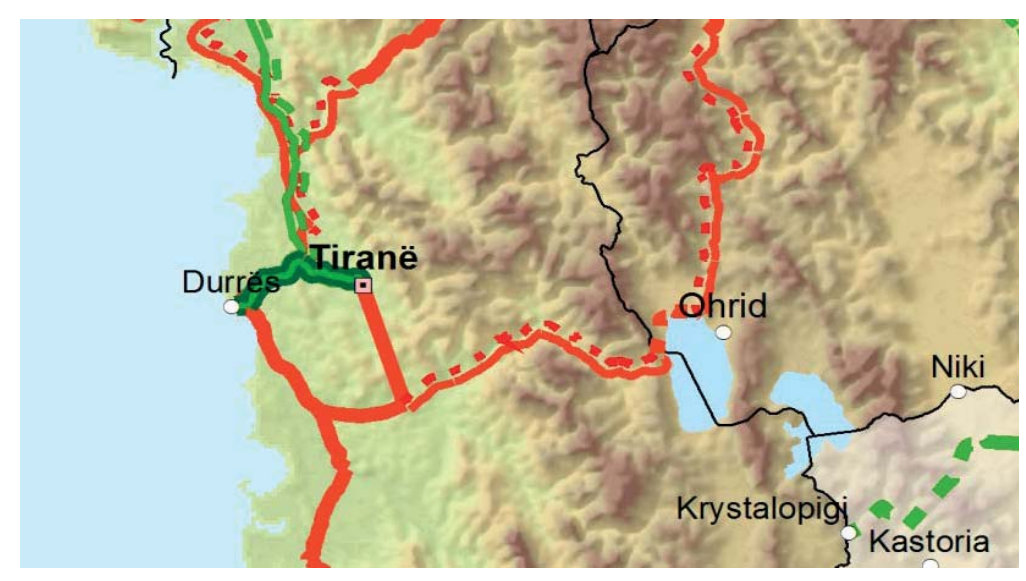
Map of Tirana - Durrës Rail Interconnection.