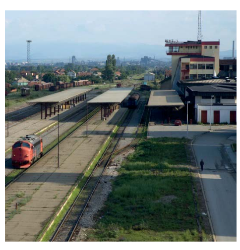
Fushë Kosovë/Kosovo Polje Railway Station.

This investment project<sup>1</sup> will cover the rehabilitation of the Fushë Kosovë/ Kosovo Polje - Mitrovicë/Mitrovica rail section and associated railway stations to modern, TEN-T standards. Whereas it includes modern signalling and telecommunications, the project excludes electrification.