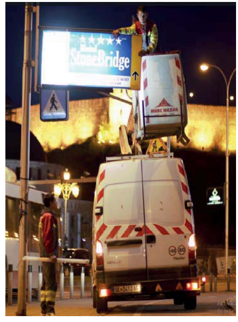
Installing LED lighting in Skopje, the former Yugoslav Republic of Macedonia.

There is a recognized need in Southeast Europe for both improving energy efficiency in businesses and homes and generating new energy from renewable resources. This will help the region meet its growing need for cleaner energy, while reducing dependence on imported enerav sources and providing cost savings and efficiency gains. In order to address such investment needs, the Green for Growth Fund, Southeast Europe (GGF) was initiated by the EIB and KfW in 2009, with key financial support from the European Commission and the German Federal Ministry for Economic Cooperation and Development. GGF thus became the first specialized fund intended to advance energy efficiency (EE) and renewable energy (RE) in the region, innovative public-private through partnerships. Funding has subsequently complemented by other financial institutions. The additional, €20 million, contribution from the European Union<sup>1</sup> will be used to support the Fund's growth in Southeast Europe and to successfully continue its mission of fostering EE and RE investments in the region.