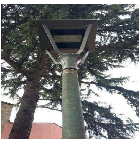
Mounting of New LED Lanterns in the Old Town of Novigrad, Croatia

The additional, €30 million, contribution¹ from the European Union will be used to support REEP in further advancing energy efficiency (EE) and renewable energy (RE) investments in the region.