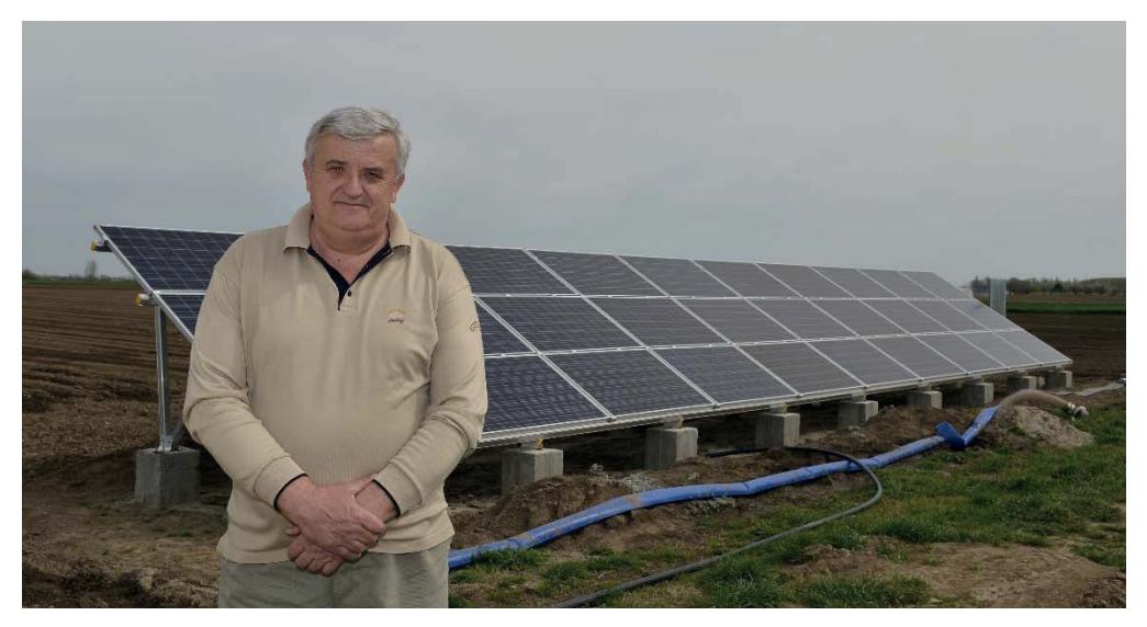
Solar-powered Irrigation Drip System in Begeč, Serbia.