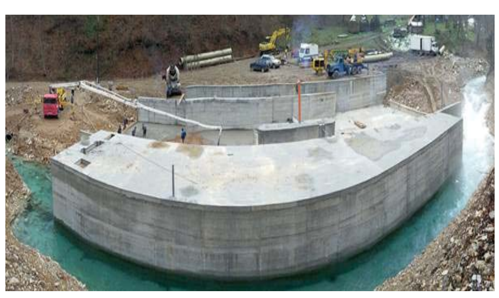
Small Hydro Power Plant in Bistrica, Montenegro